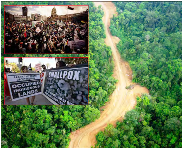
Figure 5. Protests against roads.

A mining road in old-growth rainforest in Panama that generated heated public debate. Inset above: Protest against a government-approved highway that will cut through indigenous and protected areas in Bolivia. Inset below: Protest against a planned highway in indigenous lands in Arizona, USA.