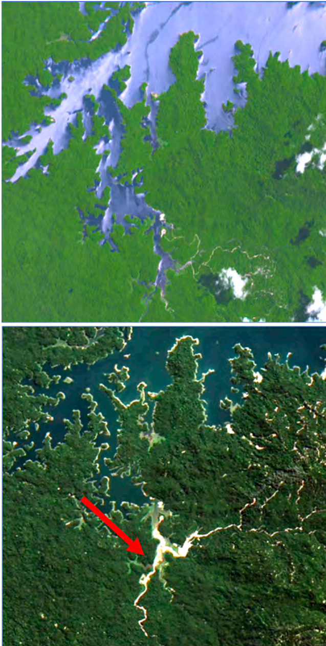
Figure 2. High sediment load in a tropical river.

Satellite images showing pre-logging (top, c. 2011) and post-logging (bottom, c. 2016) sediment levels in a rainforest river in the hills near Lake Kenyir, Peninsular Malaysia. The arrow highlights a river with particularly high sediment loads.