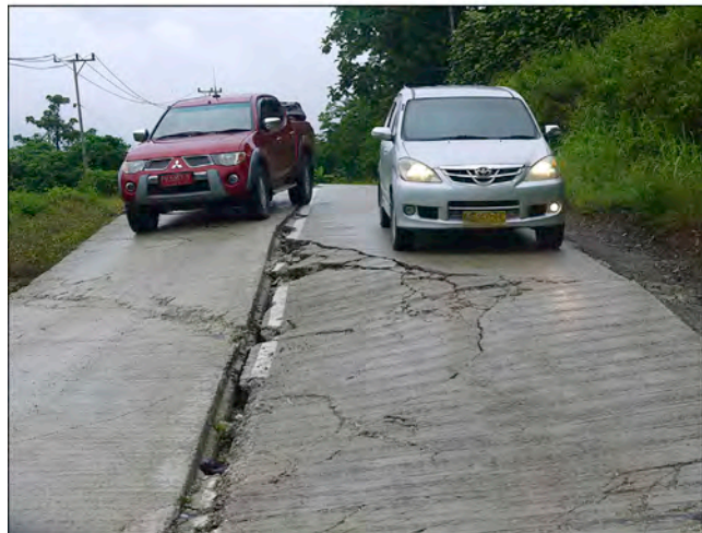
Figure 3. Potholes and slumping in tropical roads.

Large potholes (top) can substantially reduce road efficacy. Sloping terrain (bottom) in wet tropical environments is particularly prone to slumping, leading to large cracks or a collapse of the road surface.